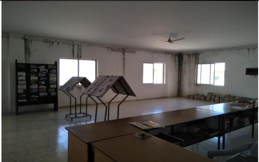
Any other facilities